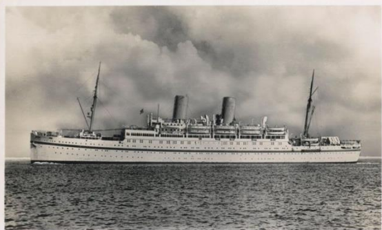
M.V. "EMPIRE WINDRUSH" (114,414 TONS GROSS)

Some of these people experienced racism due to the colour of their skin when they arrived.