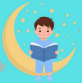
Bedtime Story theme